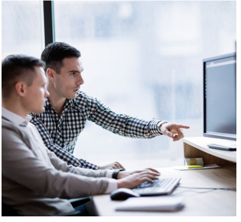
Technical Support Gravotech experts dedicated to support and guide you.