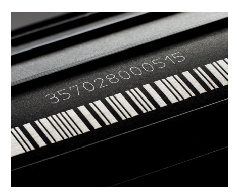
Contrasted marking on plastic